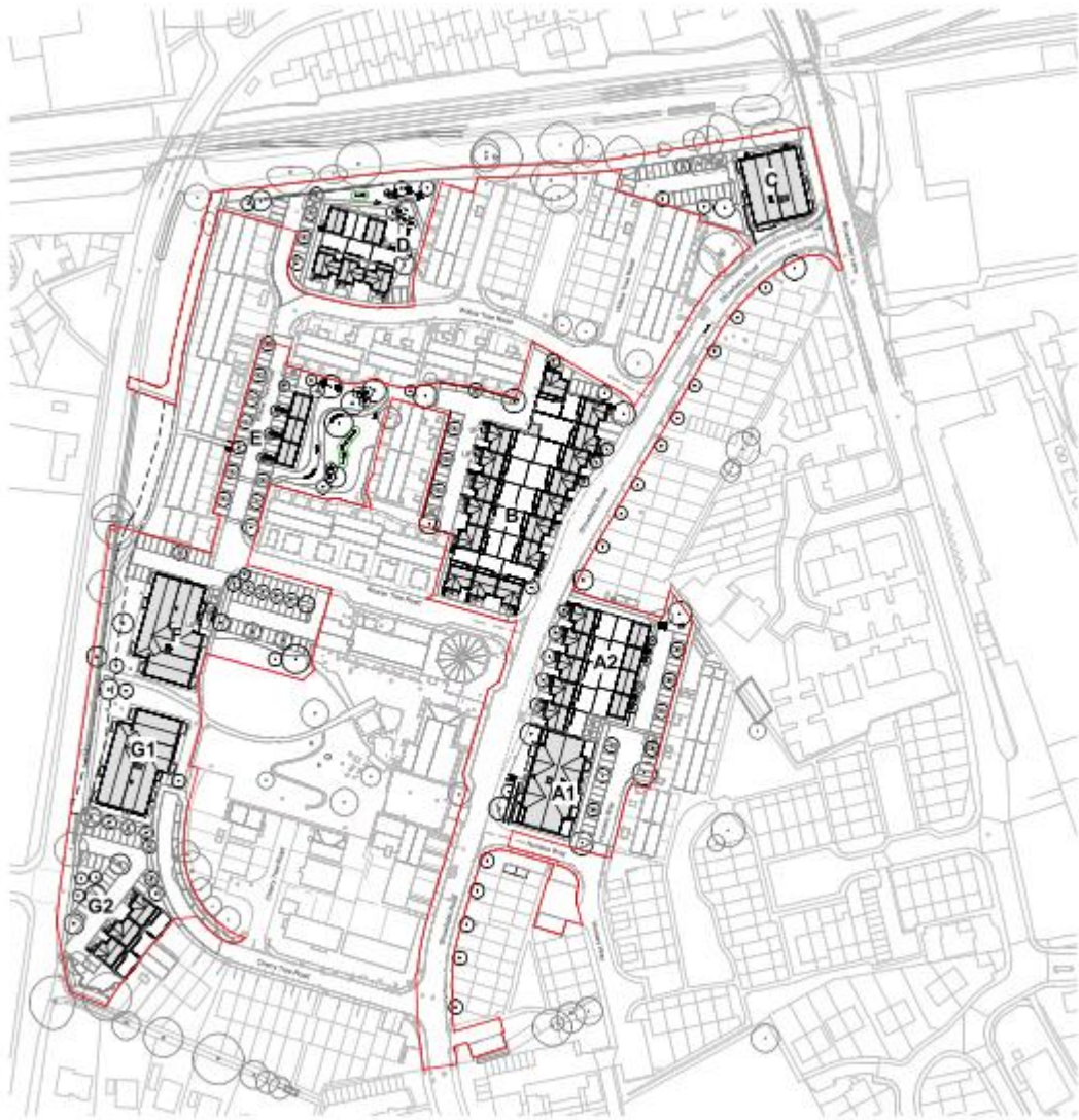
PL Proposed Site Plan 1:1000