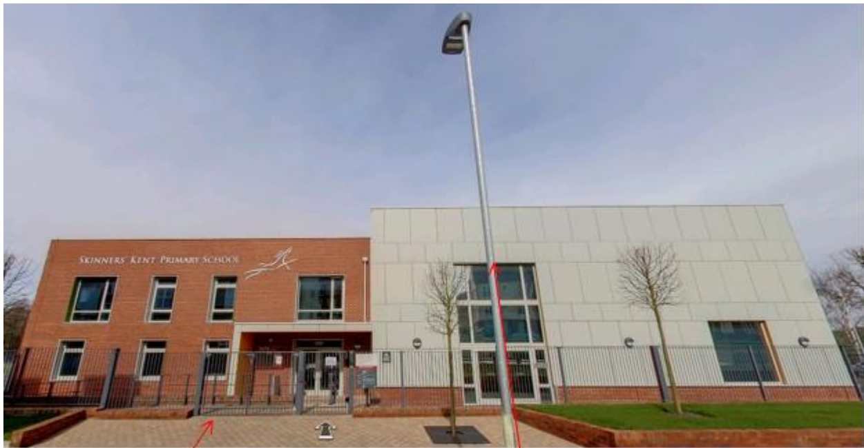
Plenty of space for signage