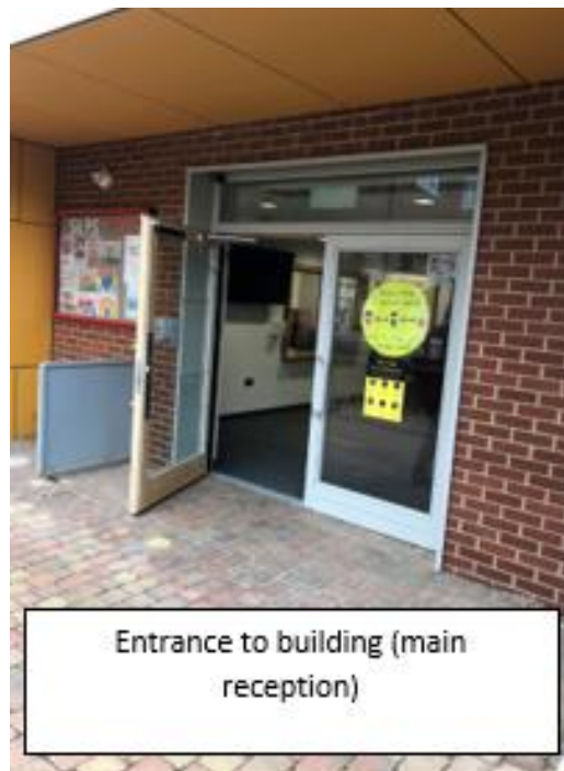
Entrance to building (main reception)

Show internal areas of the building, excluding the actual polling station where voting will take place, including corridors that link to the polling station, kitchen and toilets, and highlight any possible signage requirements and potential hazards. Also indicate door swing direction and