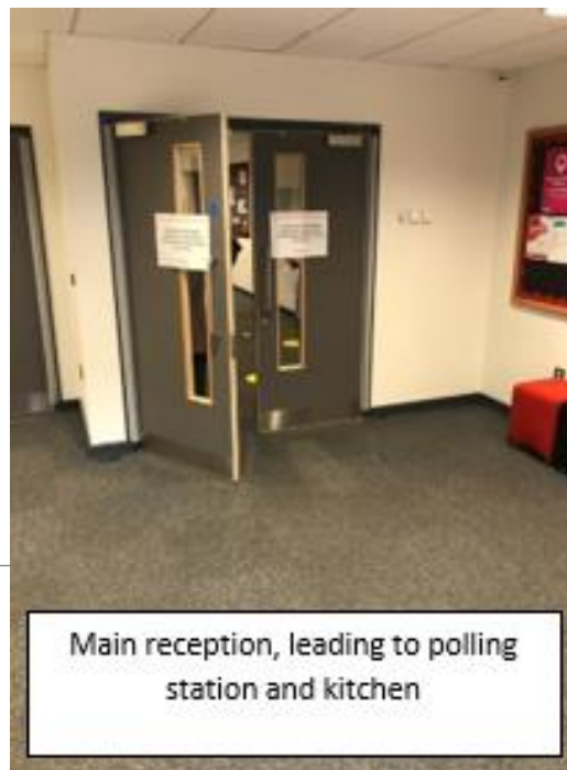
Main reception, leading to polling station and kitchen

ease of opening, any areas of poor lighting, and any areas of uneven floor, etc.