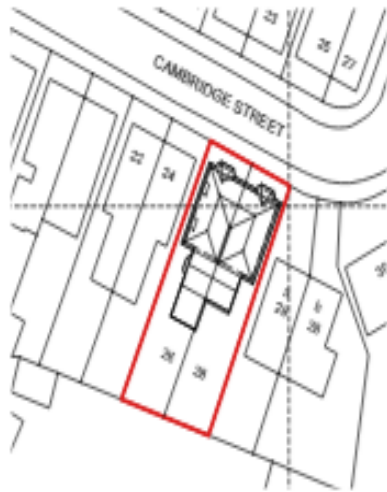
1:500 Existing Block Plan