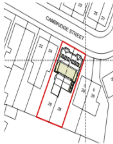
1:500 Proposed Block Plan